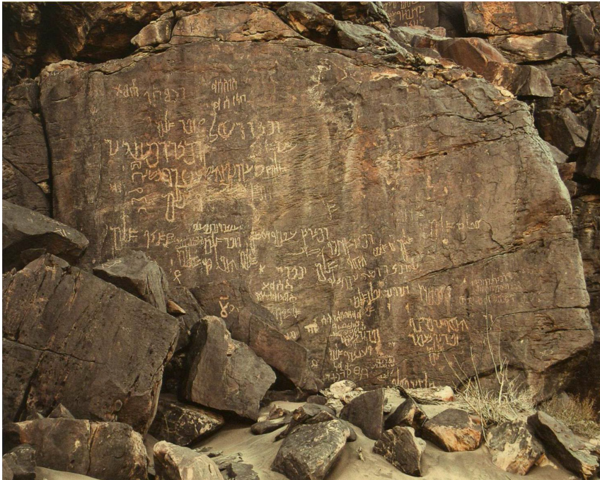
Fig. 2: Nabataean inscriptions covering a rock near Umm Jadhāyidh; Catalogue Roads of Arabia: Archäologische Schätze aus Saudi-Arabien (Berlin, 2011), p. 143.

the pre-Islamic poets– rather aroused ambivalent feelings and even seems to have exerted a destabilizing, indeed sometimes deterrent effect. It represented –to borrow a formulation from Robert Alter– ‘a discomfiting or even menacing language of otherness’ 30 . We will come back to this observation immediately.